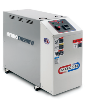
Compact water system

When a market leader in plastic injection molding contacted Mokon about their cleanroom medical component application, we accepted the challenge. Mokon's sales and product line engineers went to work calculating the heating and cooling loads and selecting the right system and options to meet the customer's exact specifications. We were able to provide a comprehensive temperature control solution that minimized waste and reduced time required to change tools and start equipment. Production goals were exceeded and our extremely satisfied customer maximized product output and improved quality.