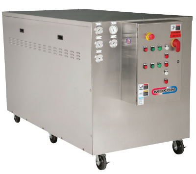
Stainless steel heater/chiller