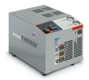
Micro/tabletop water system